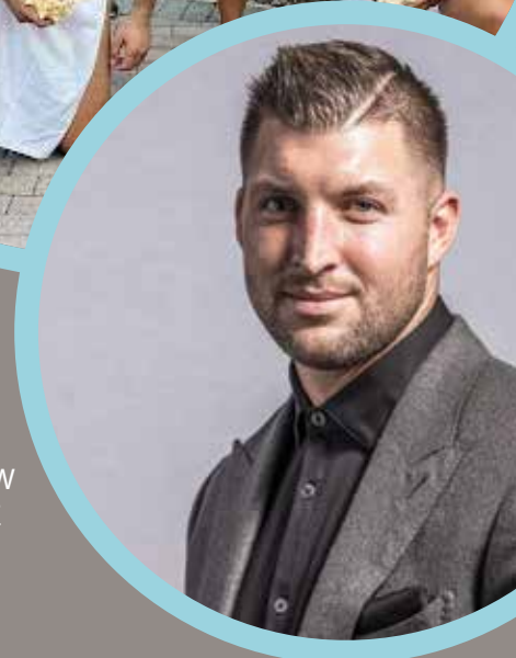
TIM TEBOW KEYNOTE SPEAKER

Omni Amelia Island Resort October 26-28, 2023